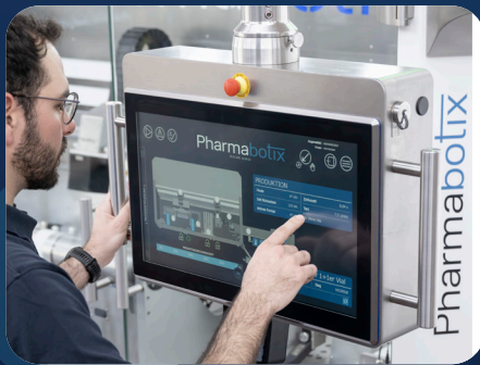
Next-level HMI & control technology