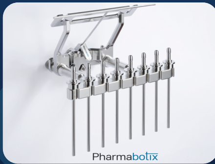
Engineering & Annex 1 lightspeed projects